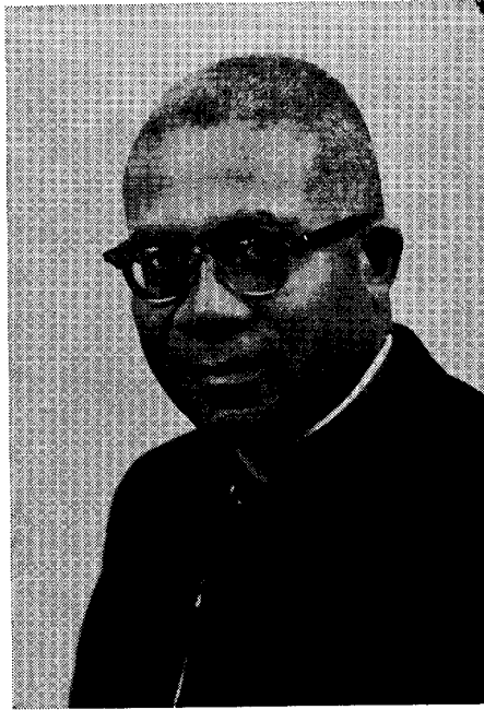
PRINCE A. TAYLOR Resident Bishop New Jersey Area The Methodist Church

"Except the Lord build the house, they labor in vain that build it: except the Lord keep the city, the watchman waketh but in vain."